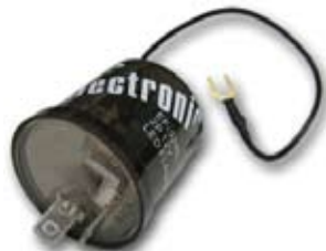
Black wire must be grounded

When using a stock bi-metal flasher, it is recommended that a standard duty flasher be used instead of a heavy duty flasher. If your turn signal circuit includes LED turn signals in the front as well as the rear, the turn signal circuit will not have enough resistance load to operate an original bi-metal flasher and this no-load flasher will be required for both the turn signal and hazard flashers.