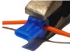
Crimp with pliers