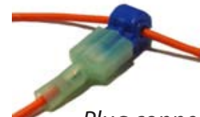
Plug connector into T-Tap

To keep the wires neatly tucked and inline, take the spliced sections and fold them over to one side and tape them in place. This will allow you to place the wiring into loom or have the ability to wrap the LED harness wiring tightly away.