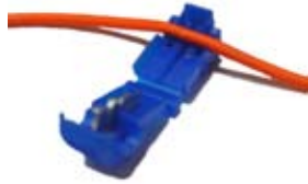
Insert wire onto T-Tap

The last page is a wire diagram of how the LED harness splices into the car's original harness.