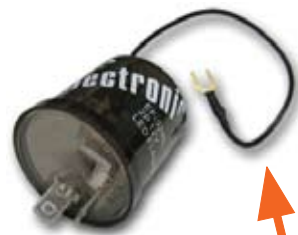
Black wire must be grounded

When using a stock bi-metal flasher, it is recommended that a standard duty flasher be used instead of a heavy duty flasher. If your turn signal circuit includes LED turn signals in the front as well as the rear, the turn signal circuit will not have enough resistance load to operate an original bi-metal flasher and this no-load flasher will be required for both the turn signal and hazard flashers.