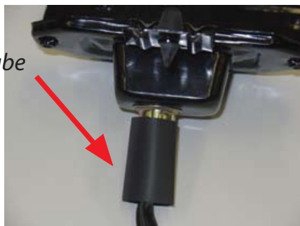
Large Diameter Tube

Slide the included heat shrink tubing over the factory tube assembly. The large diameter tube will go up by the lamp socket with the smaller diameter tube will seal the wires to the tube assembly. Re-install the factory grommet as shown below. Use a heat gun to heat shrink the tubing in place.