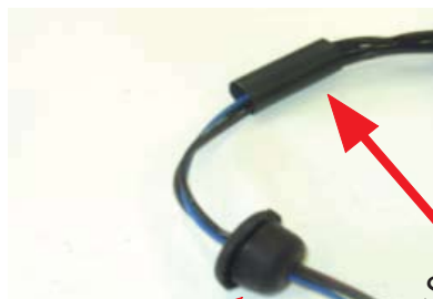
Small Diameter tube